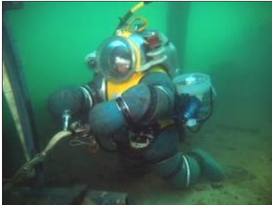
Atmospheric Dive System (ADS) training at TUCF.