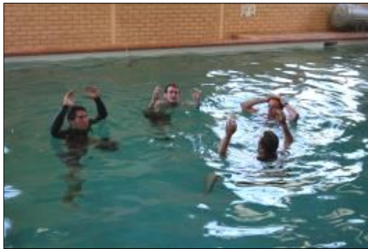
Students completing pre-requisite swimming tests for ADAS Part 1 in the TUCF Pool.

Whilst the course includes some work on Saturdays, and Tuesday or Thursday nights, these can be rearranged to suit the requirements of course participants. A detailed course program will be developed in consultation with students on the first day of the course.