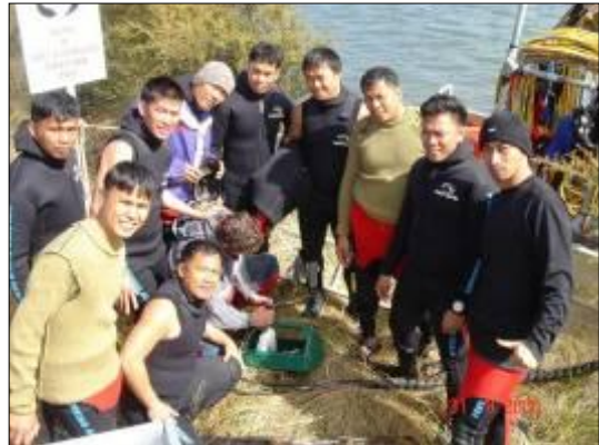
ADAS Part 2 divers completing training at Lake Stockton.