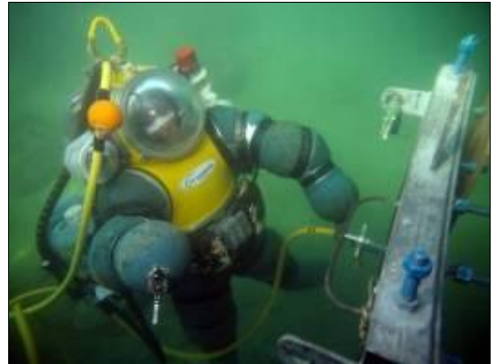
Atmospheric Dive System (ADS) training at TUCF.