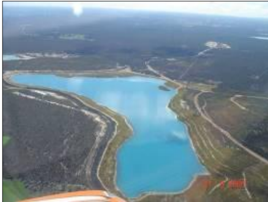
Ariel view of Lake Kepwari near Collie.