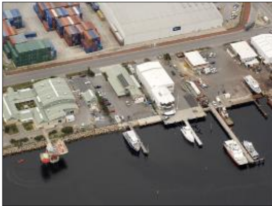
Aerial view of TUCF in Rous Head Harbour