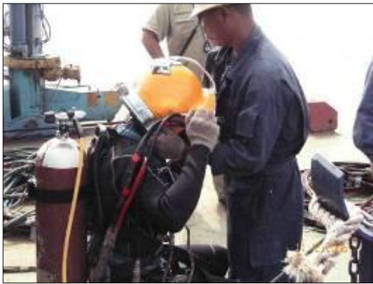
ADAS Mixed Gas diver training, conducted by TUCF for the Royal Malaysian Navy (RMN)