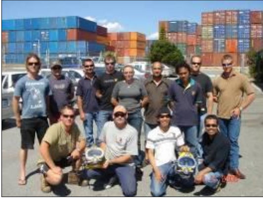
The last day of training. A recent Part 3 course at TUCF.