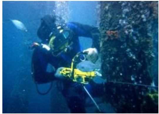
ADAS Part 2 divers complete tools training