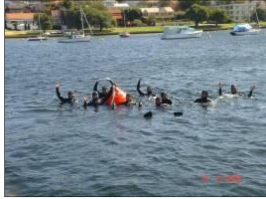
Divers under training on the Swan River, Fremantle.