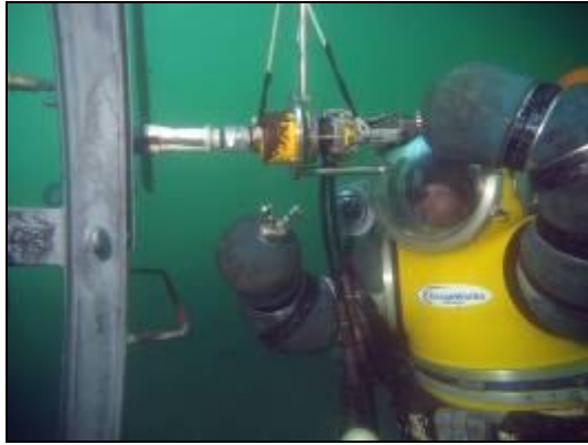
Atmospheric Diving System (ADS) training at TUCF.