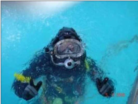
ADAS Part 2 Diver training at Lake Kepwari