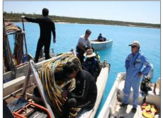
Deep diving operations in Lake Kepwari, Collie