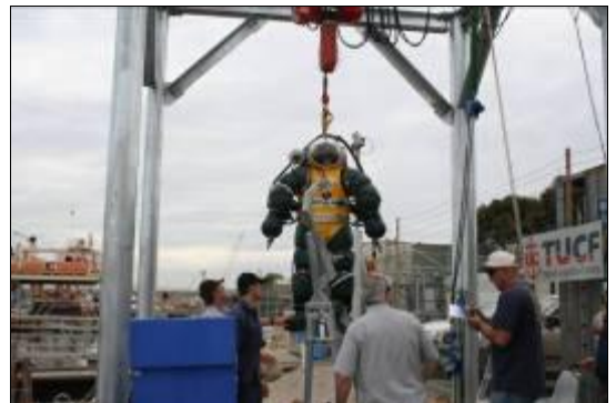
ADS Launch and Recovery Systems (LARS) at Rous Head.