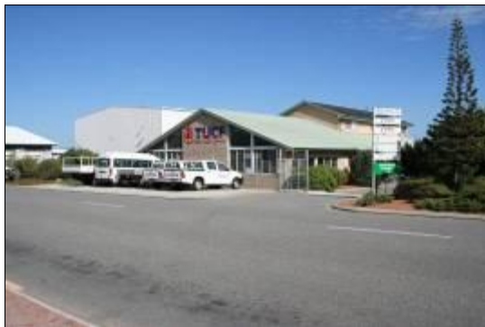
TUCF training facility in Rous Head, Fremantle.

Most of the largest local and international employers of commercial divers in Australia are based in Perth, close to our facilities in Fremantle. This gives TUCF unsurpassed access to current industry trends, direction on industry training requirements, as well as access to the key employers for our divers on completion of their course.