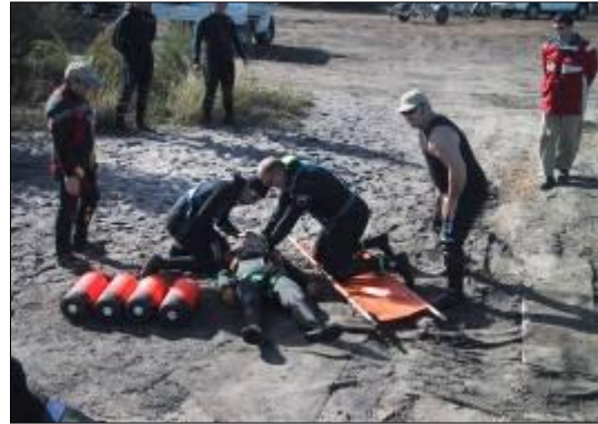
ADAS Part 1 divers complete emergency accident management training at Lake Stockton, Collie.