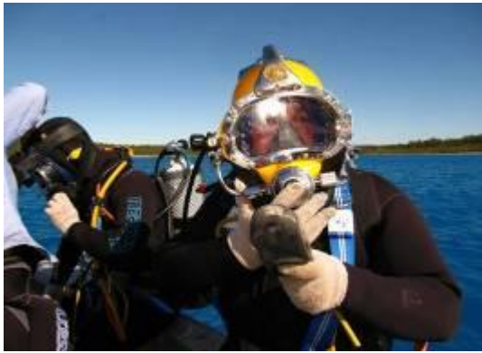
ADAS Part 2 SSBA Training at TUCF