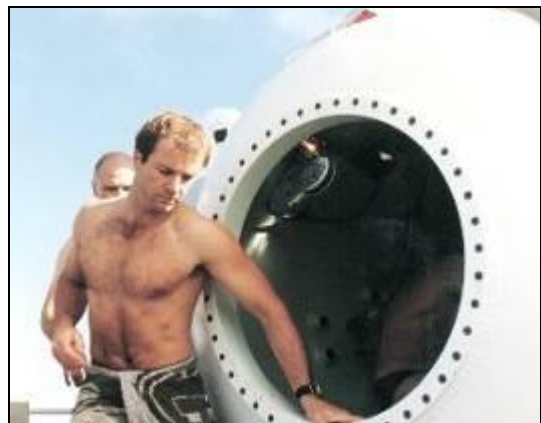
Surface decompression at Rottnest Island.