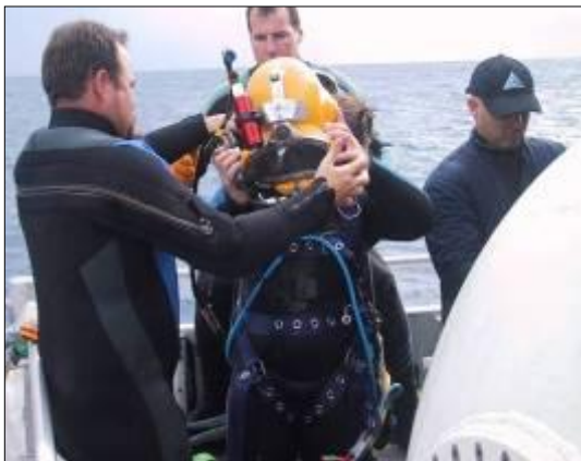
Surface decompression at Rottnest Island.

In addition to the above, non-divers will also cover; Boyle's Law and how it applies to barotrauma of descent & barotrauma of ascent. Henry's Law and how it applies to decompression sickness. Dalton's Law and how it applies to gas toxicity CO, CO 2 , O 2 , N 2 . Charles' Law and how it applies to hypothermia, hyperthermia. Related topics dysbaric osteonecrosis, legislation, and standard air decompression tables.