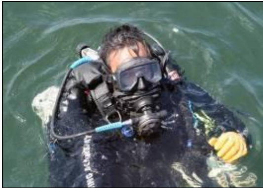
ADAS Part 1 SCUBA Training at TUCF

The qualification limits the diver to using small hand tools or conducting inspections in no decompression dives with direct access to the surface. The diver cannot operate large surface controlled power tools, or dive in operations where the use of cranes, air lifts or winches is required.