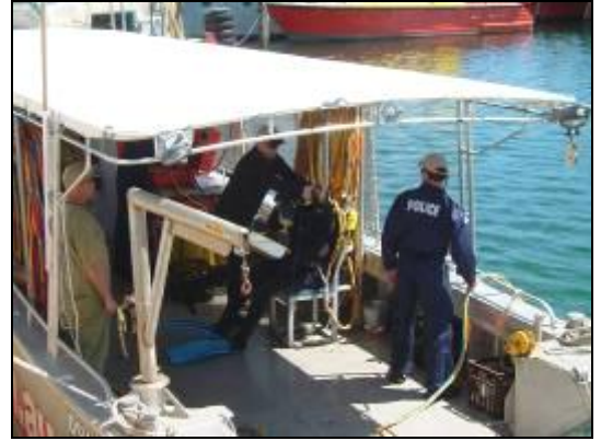
WA Water Police Diver Training at TUCF.