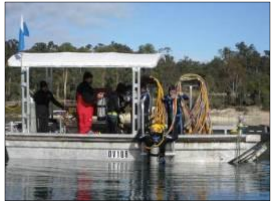
Deep diving operations in Lake Stockton, Collie

Collie District – Lake Stockton and Lake Kewari, in the Collie District of south west WA, will be used for approximately two days in each course for deep diver training.